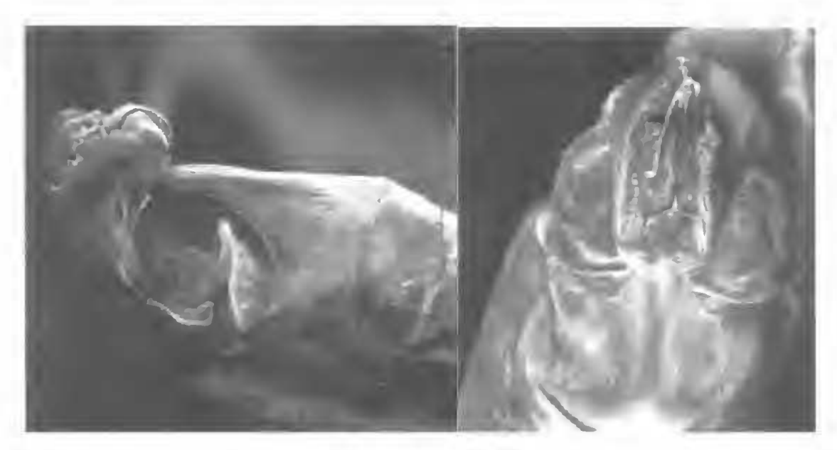
FIG. 1. Lepidiota bakkeri. male parameres.

smaller, more clongate scales with a small bare area in the middle. Antennae 10-segmented, club 3-lamellate, club 1.3mm long and as long as segments 2-7 combined. Pronotum with greatest width 1.6 times the mid length, lateral edges obviously angulate in middle, edges behind these angles almost parallel when seen from above; anterior and posterior angles slightly obtuse; without defined anterior and posterior margins; surface densely clothed with scales except for a bare area along the midlongitudinal line which is wider on the posterior half than on the anterior half. Scutellum with elongate scales, except on the midlongitudinal line. Elytra densely and uniformly clothed with white scales, except on the humeri where the scales are sparser. Propygidium with a uniform and very dense clothing of small, ovate, whitish scales on the posterior three-quarters, merging into recumbent setae anteriorly. Pygidium densely clothed with oval, white scales. Pronotal hypomera, metepisternum, metasternum and hind coxae with white scales and a few long, thin, yellow setae, setae denser and scales sparser towards the middle of the metasternum. Abdominal sternites with dense, white scales, scales sparser on the last segment. Parameres almost symmetrical, with a prominent basal process (Fig. 1).